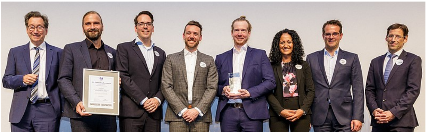
Winners of the ICV Controlling Excellence Award 2019

Detailed information and application documents are available on the ICV website ( www.icv-controlling.com -> The Association -> ICV Awards): https://www.icv-controlling.com/en/association/awards/icv-controlling-excellence-award.html